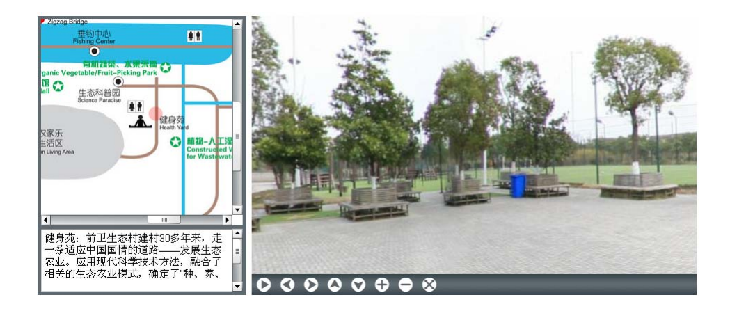
Figure 5. Panorama Roaming System. The hot spot of Qianwei Village