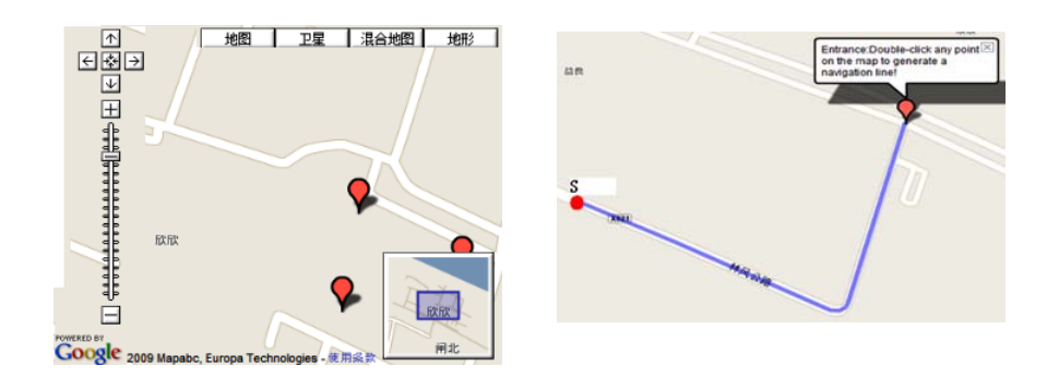
Figures 4a and 4b. Google map entry (left) and navigation tool (right)