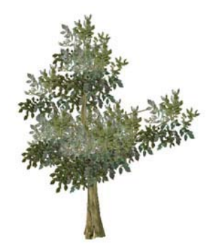
Figure 2. Hand designed 3D tree model

A single flat image is sufficient to display a plant. This technique, called billboard or impostor is classical in VR. Art designed trees were designed from popular 3DS Max tool (3DS, 2010) and use simple geometry for branches and impostor (figure 2).