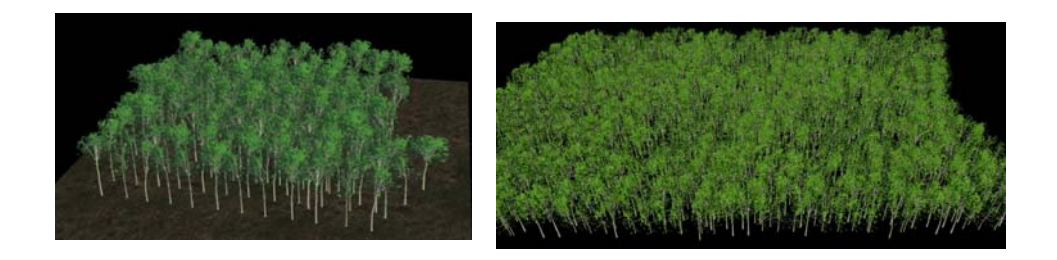
Figure 3. VRML forests generated automatically from individual tree scenes. 120 single trees rendered as billboards (left) and 3000 trees rendered using low cost geometrical models (right)

Both techniques were used to generate VRML scene files. Dense vegetation fields are described by a simple location list, that can be generated by a planting tool editor -we use the free SIMEO tool (SIMEO, 2010), developed by CIRAD within the CAPSIS platform (De Coligny, 2007). The scene, stored as a simple text file plant position list is then converted to a VRML file, referring to vegetation individual models through "#inline" calls. Each individual tree geometrical model can be defined from previously cited techniques. In the following example (figure 3), polygons and single billboard approaches are used.