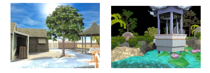
Figure 6a and 6b. VRML 3D scenes, historical old farm (left) and old temple (right)

We have also developed a set of VRML 3D scenes related to Qianwei village by using our proposed lightweight modeling methods. We have reconstructed an historical farm and also a small temple site. Two corresponding snapshots are shown below (Figure 6). Such scenes are also popped from the local maps.