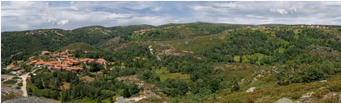
Landscape in 2009

In order to be able to target policies to make best use of regional potentials of landscape functions methods are proposed that quantify the region-specific potentials of the landscape to support different landscape functions. The identification and simulation of the potentials of a location to provide landscape functions provides an additional layer of information complementary to the assessment of actual landscape functions and their change. At local level participatory scenarios may be used to identify the local potentials by confronting stakeholders with possible scenarios and visualisations (van Berkel et al., in prep). At larger scales simulation methods and indicator assessments are needed to quantify these potentials. Most critical is the assessment of pathways towards better using these potentials. Therefore, confronting explorative scenarios with visions on regional potentials may help to identify the region specific assets and constraints towards moving into sustainable development pathways.