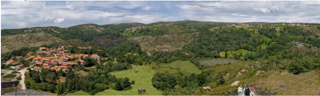
Visualisation of scenario with multi-functional landscape development